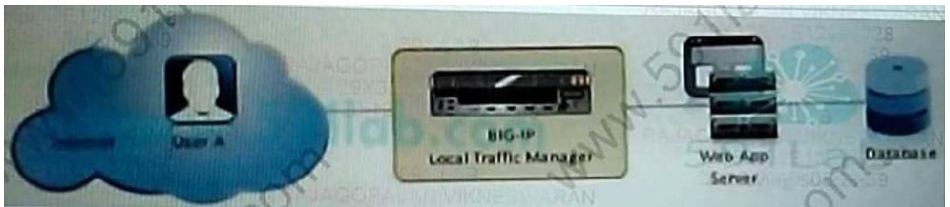
Exhibit. the Web application Server made a query to the Database to present dynamic content for a user who would be the client?