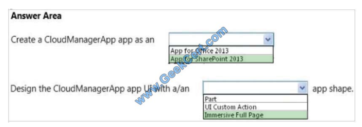
Box 1: App for SharePoint 2013 Box 2: Immersive Full Page

* Immersive (or full-page app): This shape provides a fully immersive experience by using the entire page. While this gives you complete control over the app experience, it is important to make sure that your app properly links back to the SharePoint site, so the user experience feels integrated and not lost. To make this simple, we provide a chrome control that not only lets your app automatically point a user back to their SharePoint environment, but it also provides your app with the current SharePoint cascading style sheet (CSS). So when SharePoint changes its CSS, say, through a theming change, your app will change its look and feel as well.