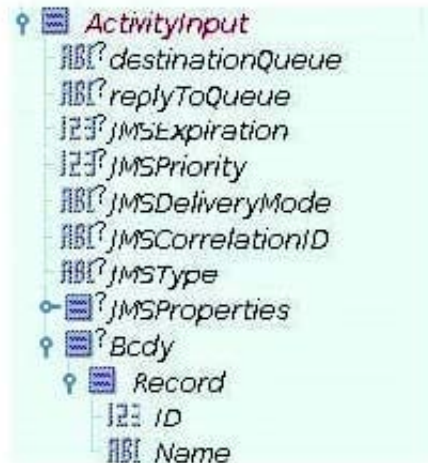
Activity B Input

You need to map the "any element" data in Activity A to a structured object in Activity B. What should you use?