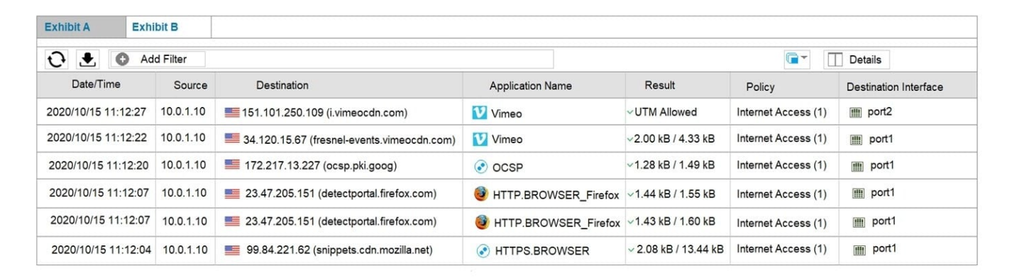
Exhibit A shows the SD-WAN rules and exhibit B shows the traffic logs. The SD-WAN traffic logs reflect how FortiGate processed traffic. Which two statements about how the configured SD-WAN rules are processing traffic are true? (Choose two.)

2024 Latest geekcert NSE7_SDW-6.4 PDF and VCE dumps Download